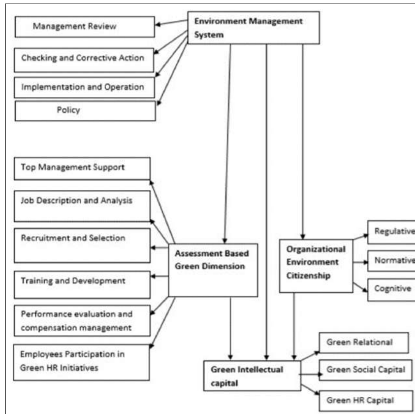
Fig 2: Model of Green HRM and Organizational Sustainability (Image Source: International Conference on Sociality and Economics Development, Singapore, 2011)